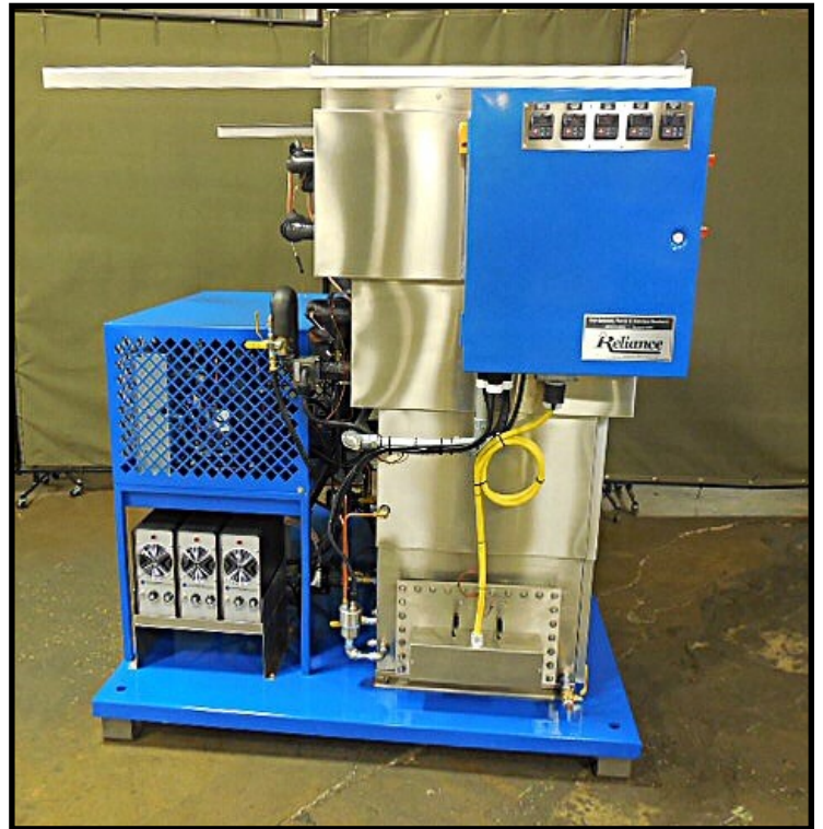
ULTRA — Profile with ultrasonics, filtration, Control Panel Display System, & easy access clean-out door