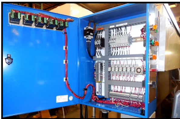
ULTRA — Electrical Panel with sophisticated temperature display & indicator light system