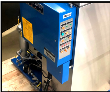
Simple Control Safety Panel