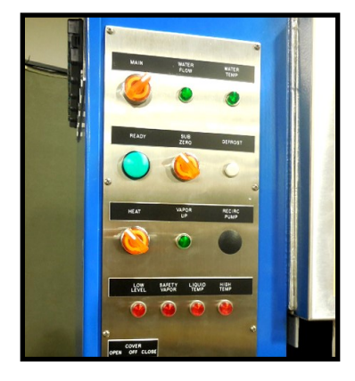
Simple Control Safety Panel