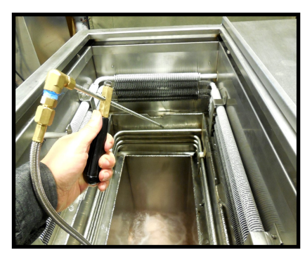
Hand Operated Spray Lance System