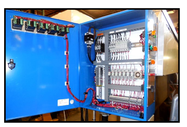
ULTRA Model VS Electrical Panel with sophisticated temperature display & indicator light system