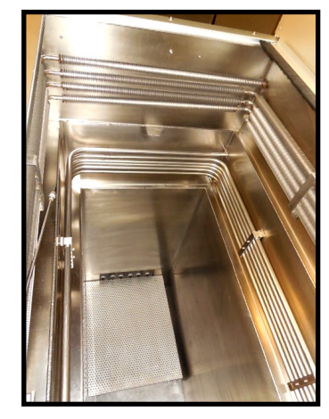
Sub-Zero Coils Operating at -20F for enhanced containment