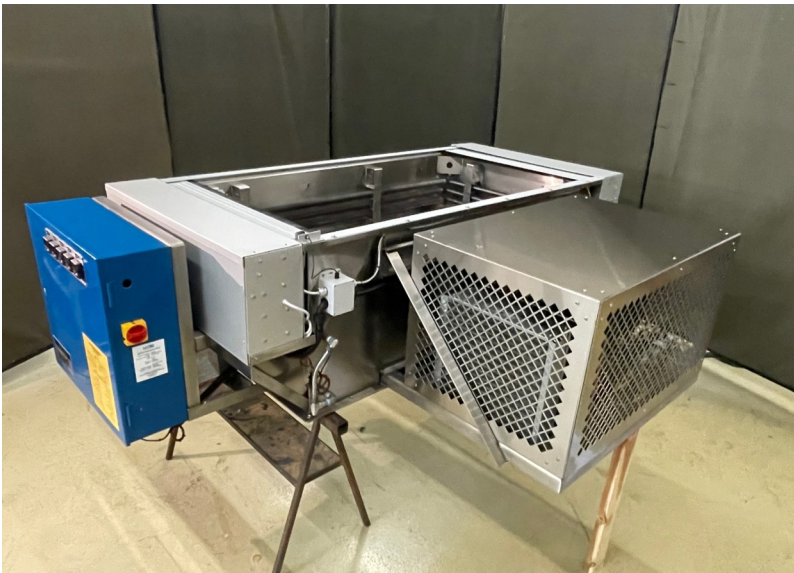
ENTIRE REFRIGERATION SYSTEM MOUNTED TO MODULE