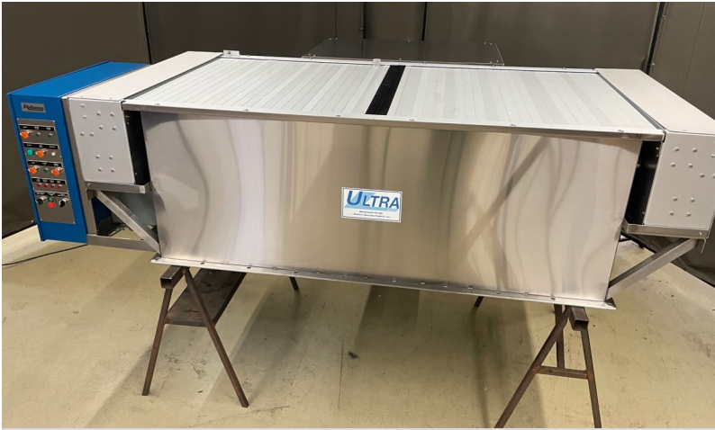
TURN-KEY, SELF CONTAINED MODULE WITH POWER LID