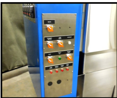
Simple Control Safety Panel