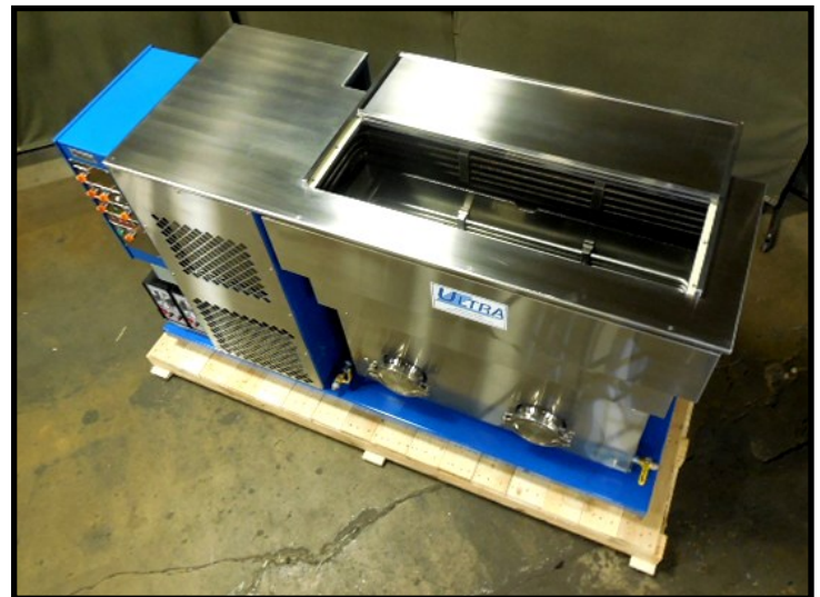
Process parts at ground level.