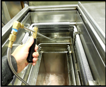
Foot Activated Spray Lance System