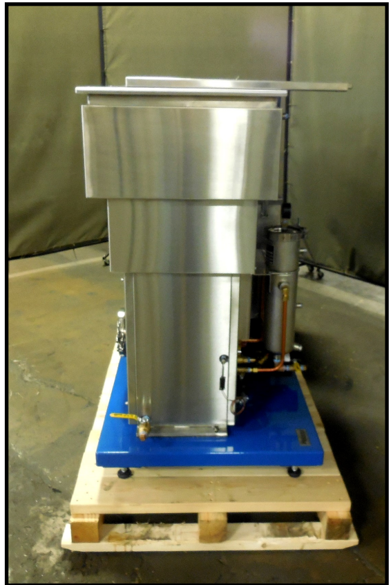
Narrow width of 30" fits through standard doorway