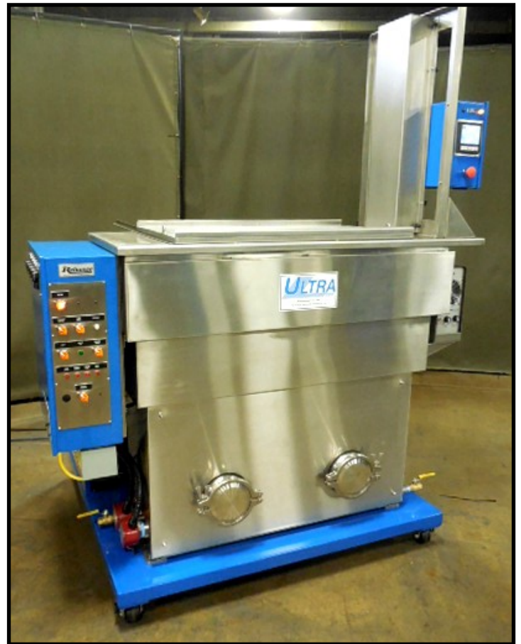
Optional Vertical Basket Handling System for loads up to 35 lbs.