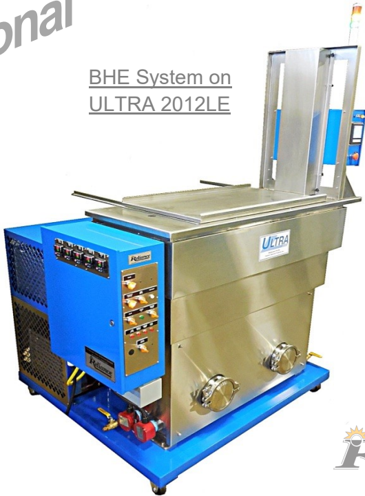
BHE System on ULTRA 2012LE