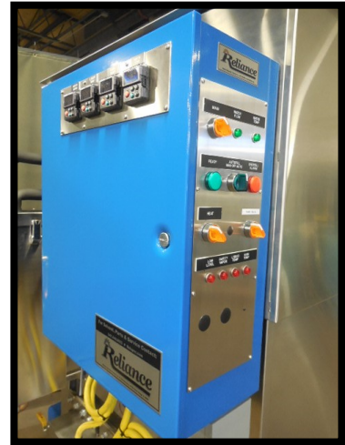
Simple Control Safety Panel