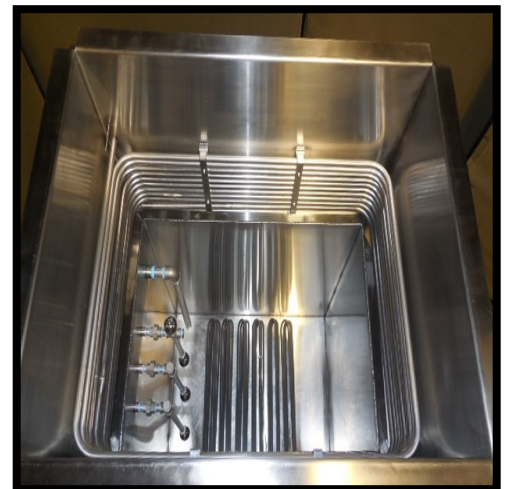
Primary Refrigeration Coils running standard R134A refrigerant